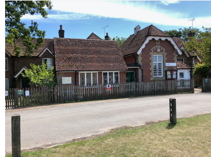
HALE SCHOOL AS IT IS TODAY WITH A LARGE EXTENSION TO THE SIDE